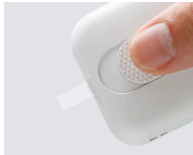
Test strip disposal lever