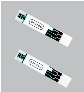
Test strip for GLUCOCARD W